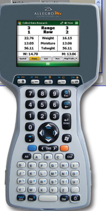
FRS harvest on Allegro MX