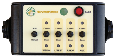
HM800 System Console